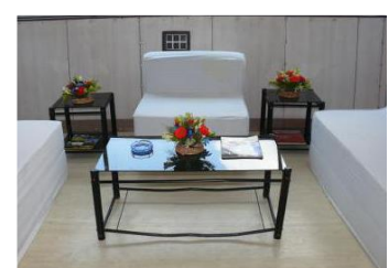
Air-conditioned Sitting Area