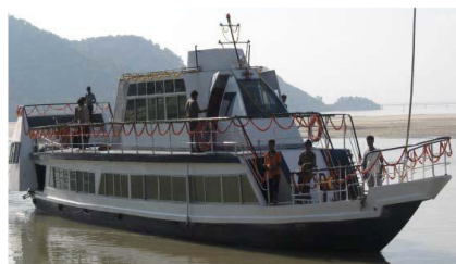
Houseboat S. B. Agam