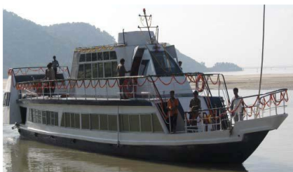
Houseboat S. B. Agam