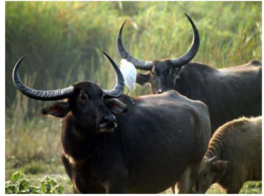
Wild Buffaloes, Kaziranga

In Majuli, we will visit some Sattras, and experience the culture & life in Sattras. We also take a short visit in a nearby village to know about the Assamese life & culture. Dinner and overnight stay in lodge at Majuli.