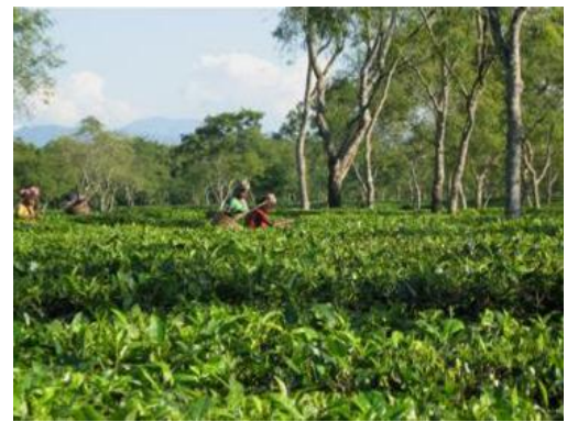
Tea Garden, Kaziranga