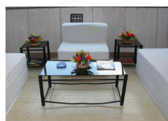
Air-conditioned Sitting Area