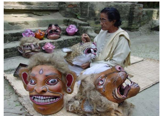
Mask Making, Majuli