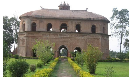
Rang Ghar, Sivasagar