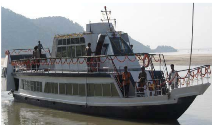
Houseboat S. B. Agam