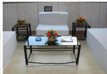
Air-conditioned Sitting Area