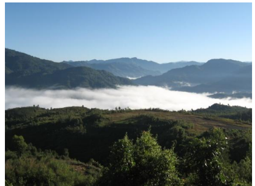
Scenic View of Shillong City