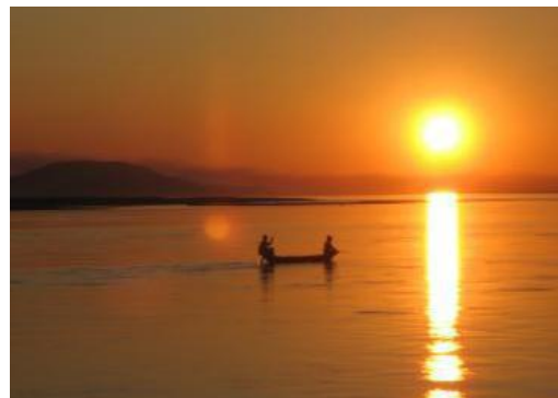
Sunset over River Brahmaputra