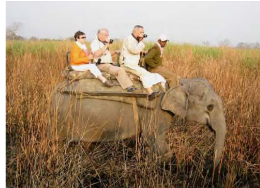
Elephant Safari, Kaziranga

Return to the lodge by noon for lunch & freshen up. We will again go for an afternoon jeep safari at another range of the park. Return to the lodge by evening.