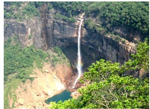
Nohkalikai Falls, Cherrapunjee